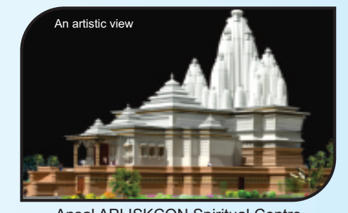
Ansal API ISKCON Spiritual Centre (Under Construction)