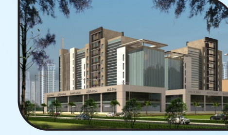
Ansal API Auto Park (launched)