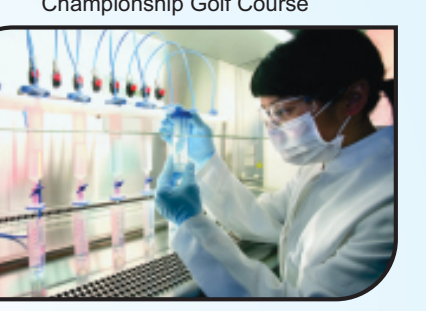
Bio-tech Park (Proposed)